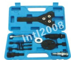
INTL-XG030 Compressor Clutch Hub Puller installer kit