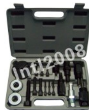
INTL-XG028 COMPRESSOR CLUTCH HUB PULLER INSTALL KIT