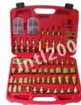
INTL-XG022 Leaking Repair Tools Kit for Europe & America car