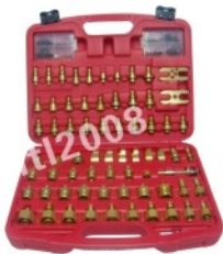
INTL-XG103 AUTO A/C LEAK TEST DEVICE R134A FOR JAPANESE CARS MATERIAL:ALU.