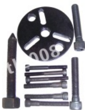
INTL-XG092 CLUTCH HUB PULLER & INSTALLER KIT