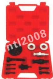
INTL-XG026 Compressor Clutch Hub Puller installer kit