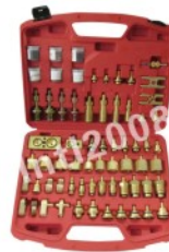
INTL-X119 TAIWAN CS-1013 MODEL FOR EUROPE & AMERICA CARS MATERIAL:COOPER