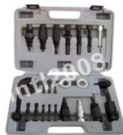
INTL-XG027 COMPRESSOR CLUTCH HUB PULLER INSTALL KIT