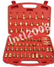
INTL-XG021 AUTO AC LEAK TEST DEVICE R134A FOR ESIA CAR