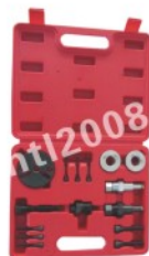
INTL-XG120 NEW A/C COMPRESSOR CLUTCH REMOVER / INSTALLER TOOL KIT