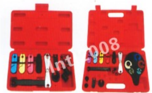
INTL-XG025 INTL-XG025A Demounting pipe tool