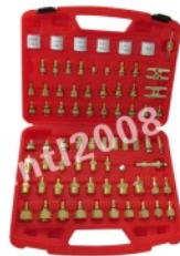
INTL-XG116 TAIWAN CS-1017 MODEL FOR UNIVERSAL JAPANESE CARS MATERIAL:COOPER