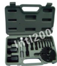
INTL-XG091 COMPRESSOR CLUTCH HUB PULLER INSTALL KIT