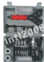
INTL-XG121 NEW A/C COMPRESSOR CLUTCH REMOVER / INSTALLER TOOL KIT