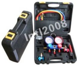
INTL-XG020 Manifold Gauge Set for R134A R12 R22 R404